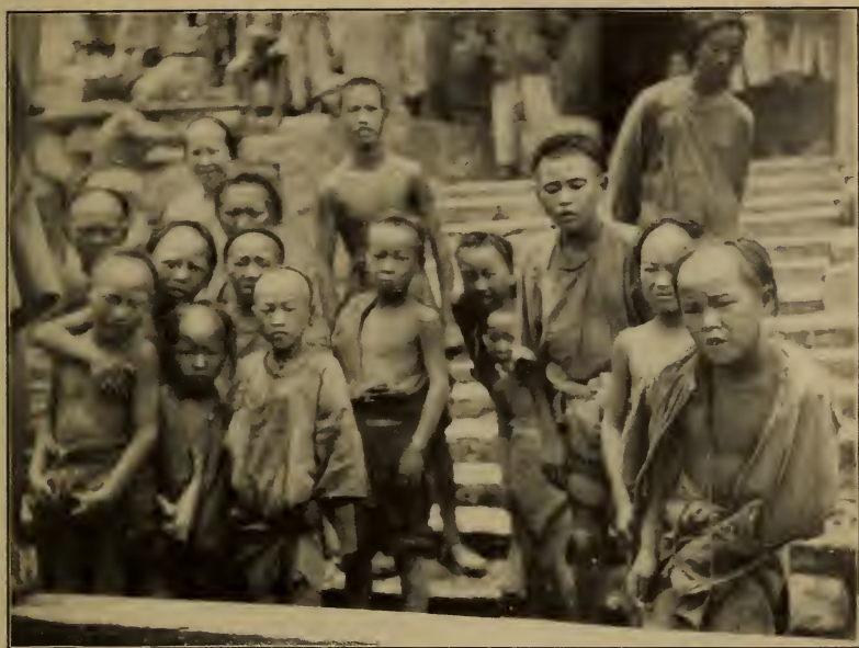
WAITING FOR THE BOAT.